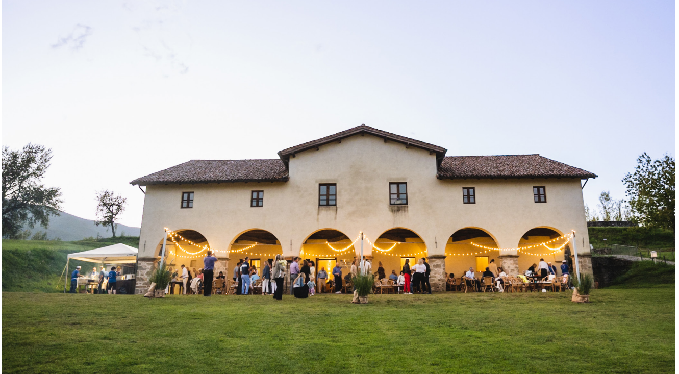
Shaner Hotel Holdings employs nearly 3000 people and operates nearly 70 hotels around the world, including a Tuscan villa in Lucca, Italy which opened this year.

most unmitigated business disaster in the history of the United States," he says. "We went from $400 million in sales to no revenue. When Covid hit, we shut down. And I'm sitting there with 3,000 employees."