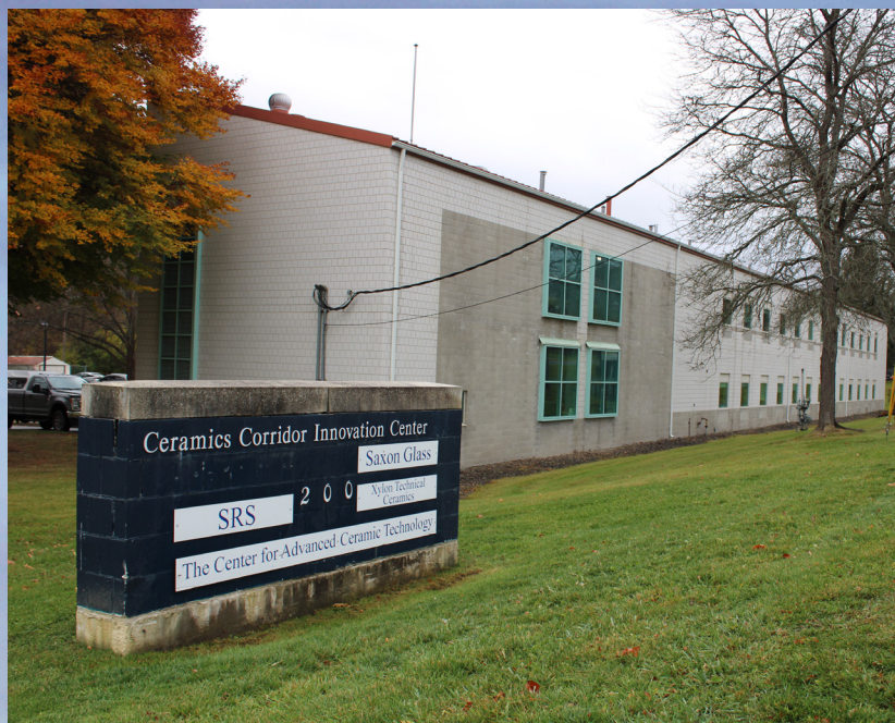
The Ceramic Incubator in the town of Alfred has encouraged business startups and outside-the-box thinking since its opening in 1992.